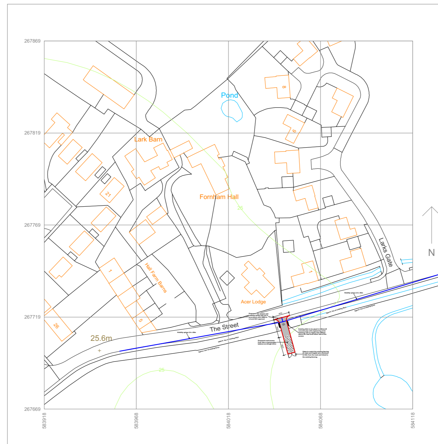
PROPOSED LOCATION PLAN 1:1250

NOTE DO NOT SCALE THIS DRAWING - USE DIMENSIONS The Contractor is to check and verify all dimensions on site before starting work and report any omissions or errors. This drawing is to be read in conjunction with all relevant consultants and specialists drawings. This Drawing is Copyright This drawing is issued for the sole and exclusive use of the named recipient. Distribution to any third party is on the strict understanding that no liability is accepted by Thurlow Architects for any discrepancies, errors or omissions that may be present, and no guarantee is offered as to the accuracy of information shown.